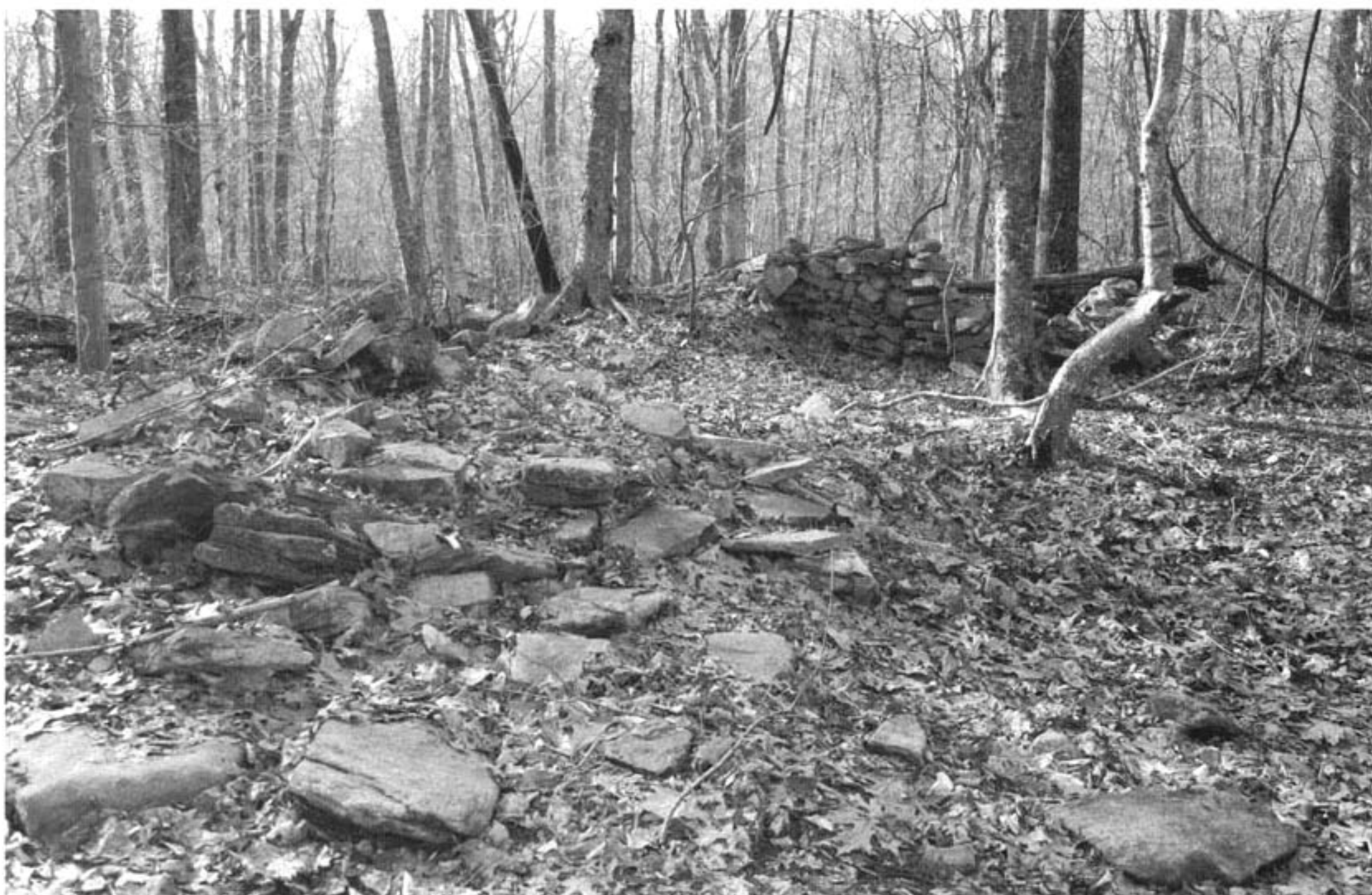
Figure 3. View of Site 102–123, excavated in 2005 and 2006. The rock pile in the foreground is the collapsed chimney stack for a framed house, and the slight depression to the right is the filled-in cellar that sat beneath that house. The stacked rocks in the background compose the small stone-wall enclosure that may have served as the base for a granary. Photograph by the author, 2008.

some nailed elements and at least one glass window pane or, alternatively, a small wooden framed structure with no foundation, no cellar or crawl-space, and no chimney. Excavation revealed three pits of varying size within a space of no more than 30 m 2 that contained a variety of domestic debris. Ceramic vessels and wares included basic redware, Astbury-type ware, Staffordshire slipware, white salt-glazed stoneware, and Brown Reserve porcelain (Silliman and Witt 2009). Iron kettle fragments and a hook were also recovered, as were a musket ball, numerous straight pins, glass beads, and white ball clay pipe fragments. Some glass bottle fragments were present, but not in great numbers. Architectural materials included forged iron nails, a small quantity of window glass, and some post-holes. Food remains include domestic livestock, fish, shellfish, and other foods (Fedore 2008).