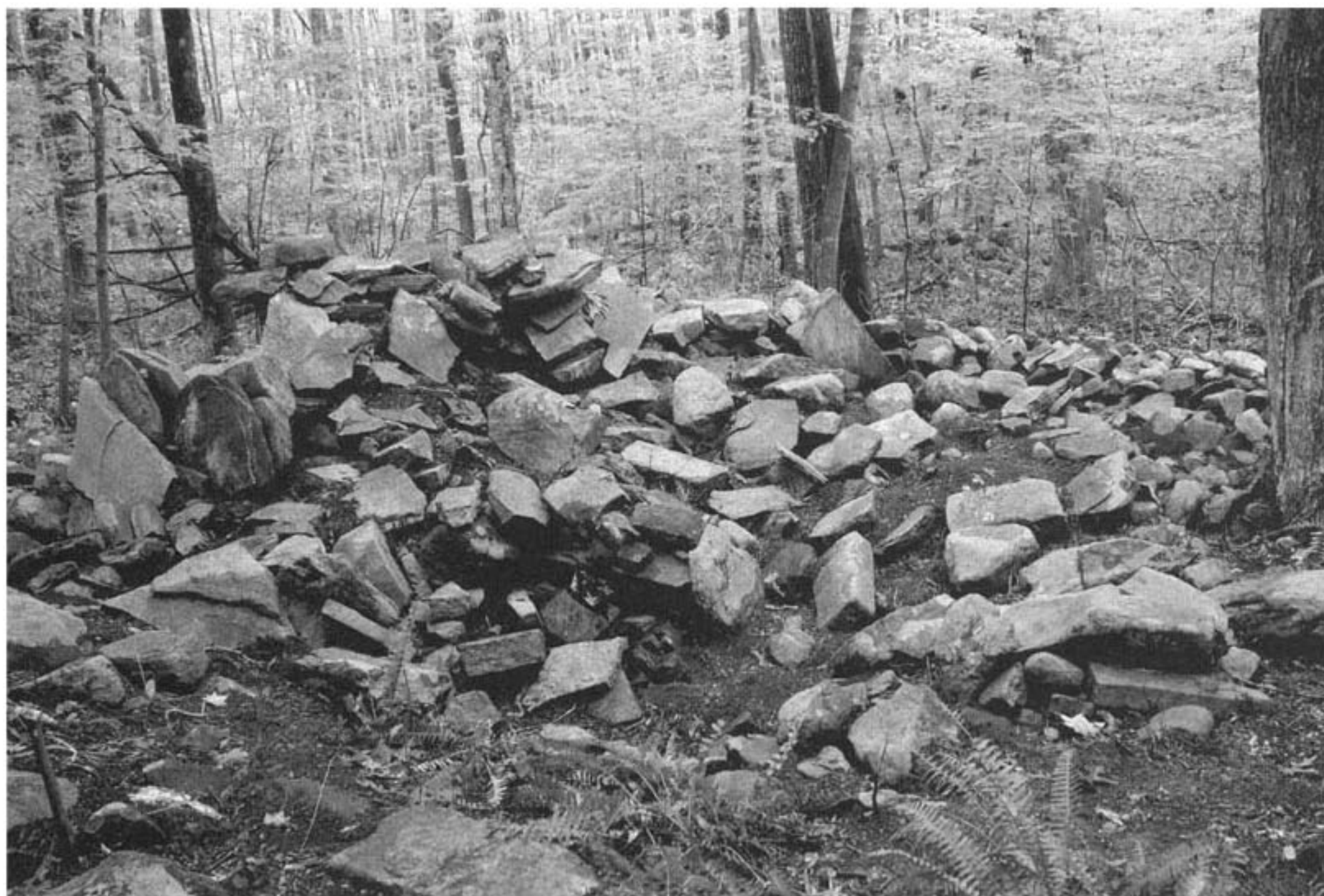
Figure 4. View of Site 102–113, excavated in 2004. The large rock pile represents a collapsed chimney stack, and the concavity framed and partially filled by these rocks represents the crawlspace that once existed beneath the house. The trash pit noted in the text was found just outside the photograph frame on the left. Photograph by the author, 2004.

metal artifacts were recovered as well, including forks, knives, buckles, finger rings, a key, and several buttons (see Patton 2007). One stone projectile point fragment of indeterminate date, a handful of chert/flint flakes, and two unambiguous pieces of worked window glass represent the lithic technologies used by site residents. Faunal remains reveal the presence of livestock (such as cattle and pigs), the use of marine resources (such as clams, mussels, oysters, and fish), and small numbers of other local fauna (Fedore 2008).